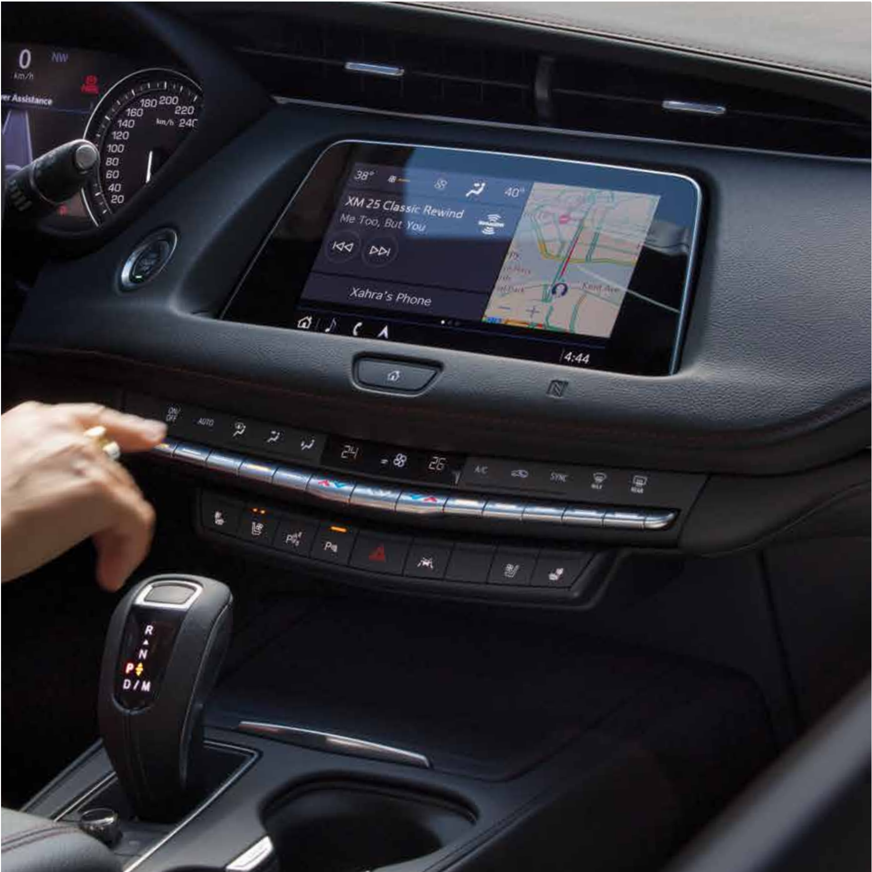
Left: The rotary controller. Top: The Cadillac user experience 1 and tactile controls.