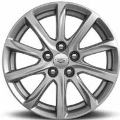
18" 10-SPOKE ALLOY WHEELS WITH BRIGHT SILVER FINISH