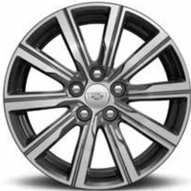
18" 10-SPOKE ALLOY WHEELS WITH DIAMOND-CUT/ARGENT METALLIC FINISH