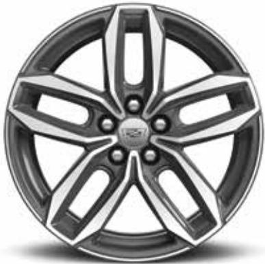
AVAILABLE 20" TWIN 5-SPOKE ALLOY WHEELS WITH DIAMOND-CUT/TITAN SATIN FINISH