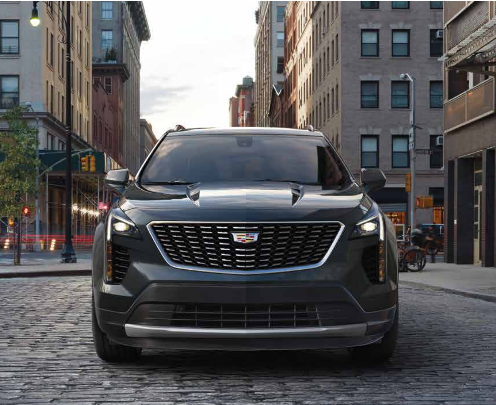
Left: XT4 Premium Luxury in Twilight Blue Metallic. Right: XT4 Sport in Shadow Metallic. Both vehicles shown with available equipment.

A model made just for you. New 2020 XT4 is the perfect way to express yourself on the road. Customize your drive and choose from Luxury, Premium Luxury and the Sport models. With unique exterior and interior features that suit your style and needs, the XT4 is a drive built to understand you. Shift to performance with the Sport model or experience the sophistication in Premium Luxury. The XT4 has everything you need.