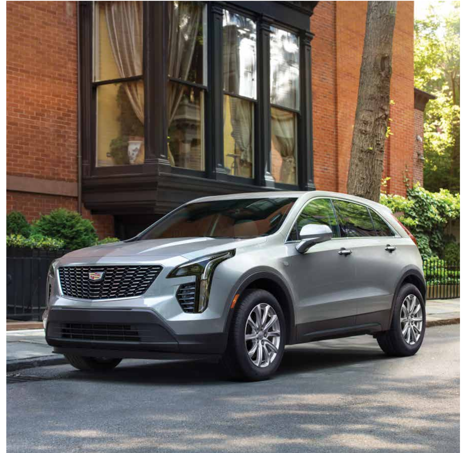
Top left: Electronic Precision Shift. Above: XT4 Premium Luxury in Radiant Silver Metallic. Shown with available equipment.